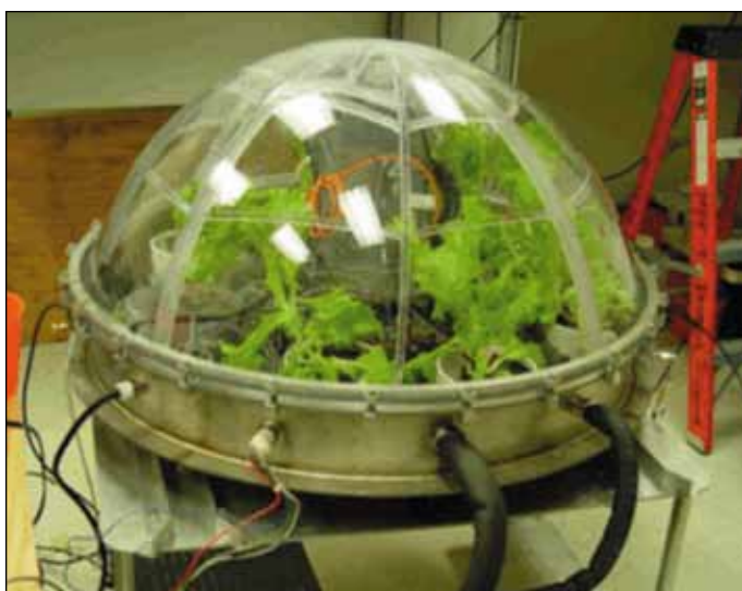
Figure 3: Waldmann's Green Lettuce grown at 25 kPa, 27° C, 75 % relative humidity and a light level of 200 \mu\text{mol}/\text{m}^2\text{-s} .

Figure 2 shows the dome and the vacuum chamber that are placed in the walk-in freezer.