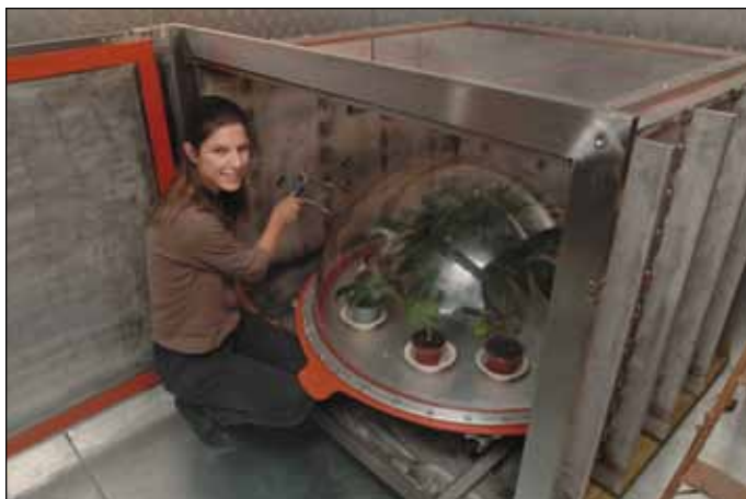
Figure 2: A greenhouse dome is installed into a vacuum chamber that simulates the low pressure and low temperature of the Mars environment.