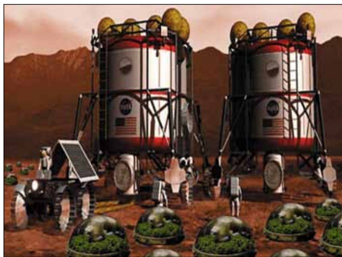
Figure 1: An artist's view of future manned missions to Mars involving greenhouses.

Mars greenhouses are important components of the human Mars mission infrastructure as plant-based life support systems offer self-sufficiency and possibly cost reduction. Resupply is prohibitive for long duration Mars missions as it increases the launch mass and consequently the launch costs. Relying on frequent resupply from Earth